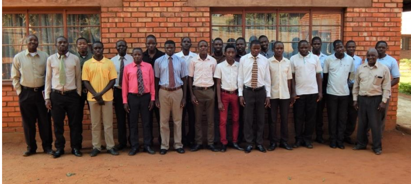
Students and teachers at the Zambia School of Biblical Studies in Livingstone, Zambia