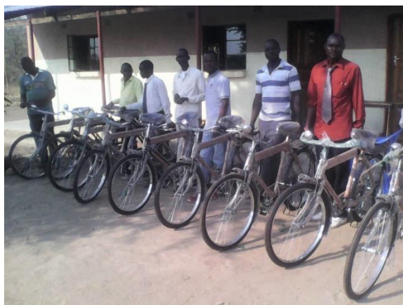
A bicycle is still an important mode of transportation in Africa so we are happy when we can provide them to preaching students so they can spread the gospel.

We had a great trip and much good was done. Before our trip we sent 200,000 Gospel tracts to Africa, 1,000 full sets of BCC booklets, 12,000 booklets, and 5,000 English Bibles, several books for preacher schools. We purchased 800 Bibles in local languages, the most we have ever purchased. This was due to help from congregations in Malaysia.