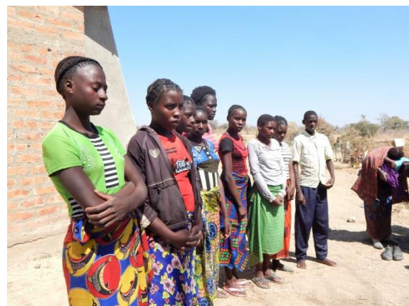
A group of teens waiting to be baptized at Siamafumba