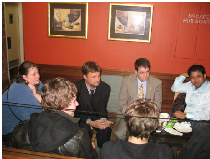
Late-night fellowship at Macker's (McDonald's) has become a tradition.