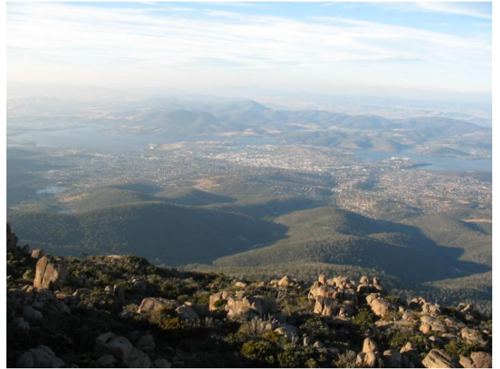
. . . and has a great view from the top.