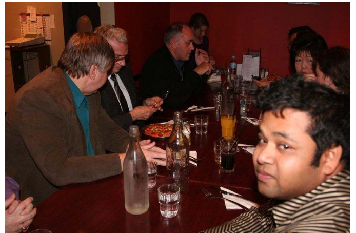
Pizza and conversation at LaPorchetta's in Salamanca on Saturday night has become another lectureship tradition.