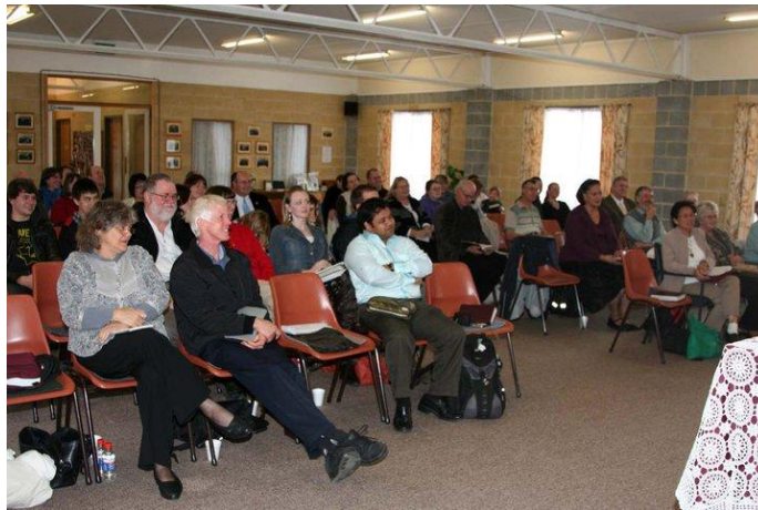
Listening to the lectures