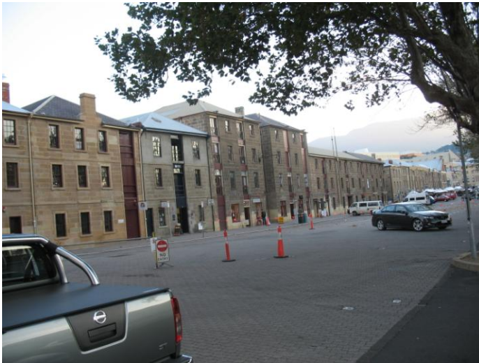
Salamanca, the old harbor area of Hobart