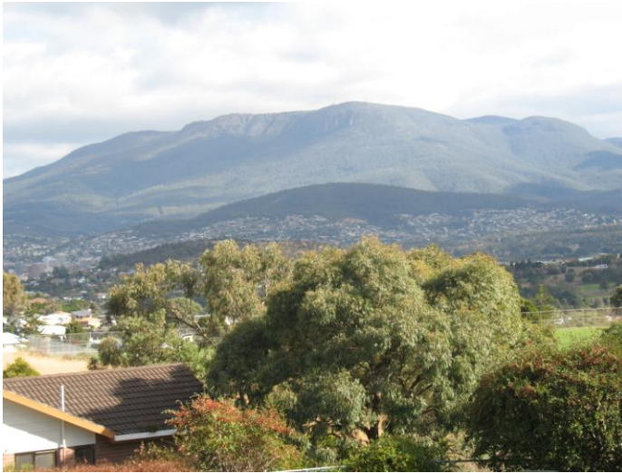
Mt. Wellington towers above Hobart . . .