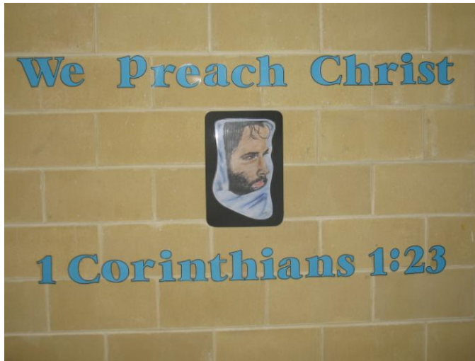
Eastern Shore Church of Christ Lectureship Hobart, Tasmania, Australia